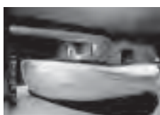
Thermal Römerbad, Bad Kleinkirchheim, Austria Project: Behnisch Architekten, Stuttgart