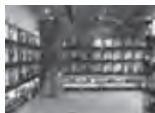
Enoteca VinoDivino, Prague, Czech Republic