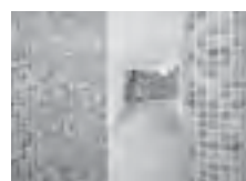
Sporting Club, Modena, Italy