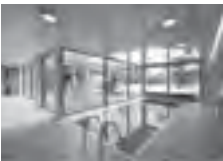
Private House, Lithuania