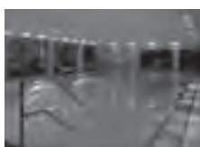
Private House, Belgrado, Serbia