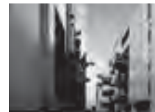
Private Building, Rende, Cosenza, Italy