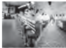
American Bar, Milano, Italy