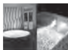
Preilos Krantas Hotel, Preila, Neringos, Lithuania