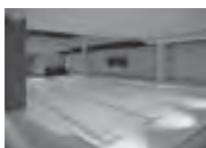
WellFit, Parma, Italy Project: Alessio Cuzzolin Architect, Mestre (VE)