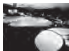
Hotel Residence Montanaria, Sarnano, Macerata, Italy