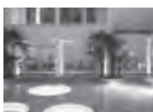
Sunrise Pearl Hotel & Spa, Protaras, Cyprus Project: George Mavrommatis Architect, Cyprus