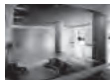
Private House, Padova, Italy