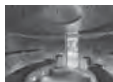
Kempinski Hotel Cathedral Square, Steam Sauna, Vilnius, Lithuania Project: Gintaras Šernius Architect, Vilnius