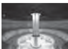
Impuls fitness center, Klaipeda, Lithuania Project: Mato Sauna, Kaunas, Lithuania