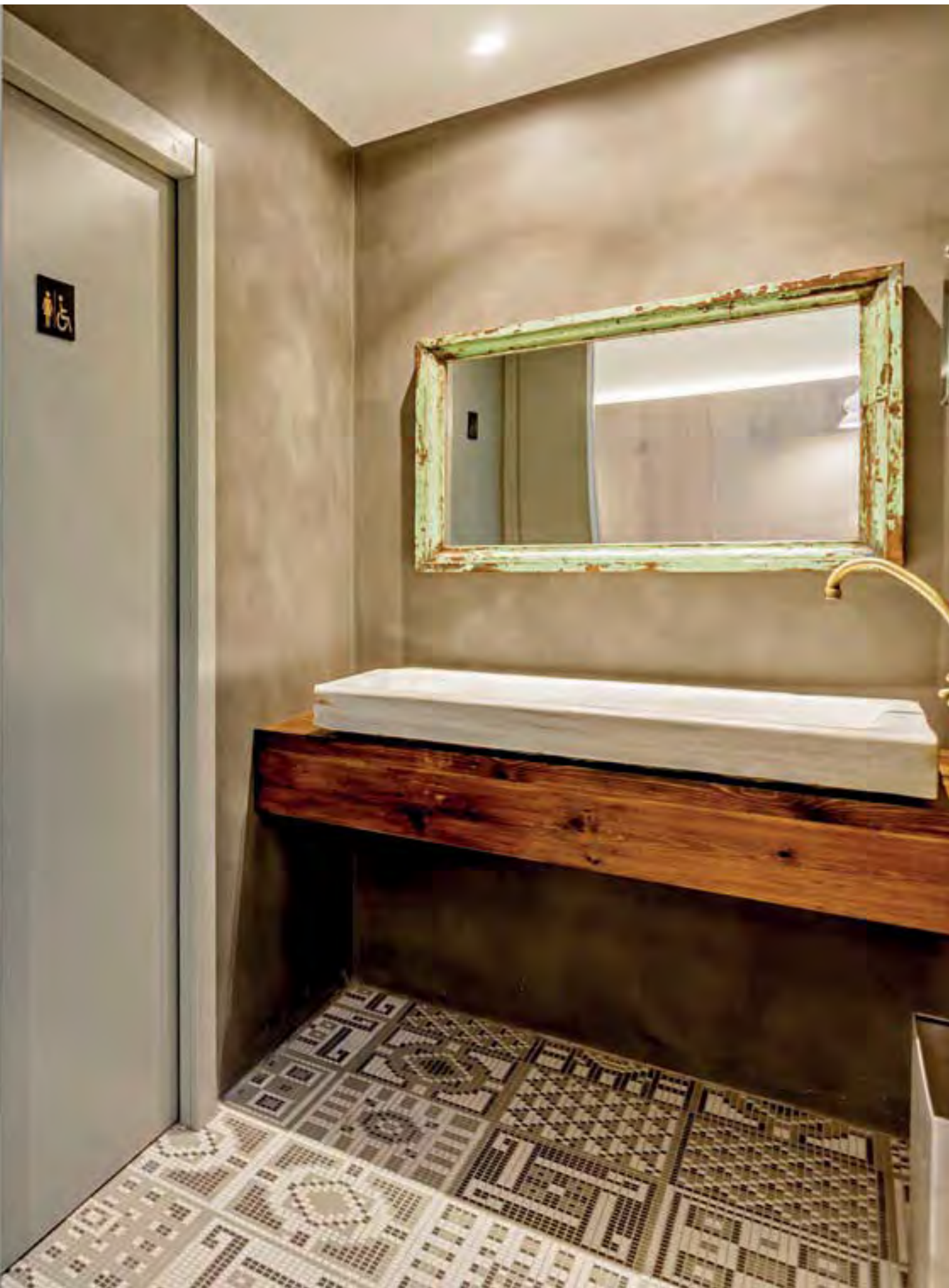
El Bruguier Cafeteria, Barcelona, Spain (personalised Memoria Ombra - 1,2x1,2 cm / 0,5"x0,5")