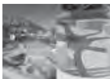
Pool & Spa Park Hotel Imperial Limone sul Garda, Brescia, Italy