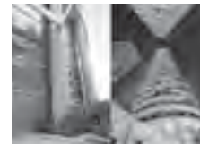
Yoo Towers, Tel Aviv, Israel Project: MOORE YASKI SVAN architects and Habas Group, Tel Aviv