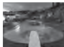
Private House, Sintra, Lisbona, Portugal Project: Piramidal Interior Design