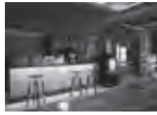
Industrial Steak House Restaurant, Romania Project: Studio Lara Design, Costanza, Roma- nia