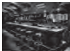
Lounge Bar, Larnaca, Cyprus