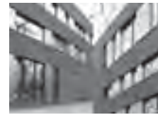
Headquarter, Budapest, Hungary