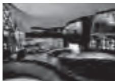
Olimia Thermae, Orhidelia Wellness, Podcetrtek, Savinjska, Slovenija Project: Studio Enota d.o.o., Lubiana, Slovenia