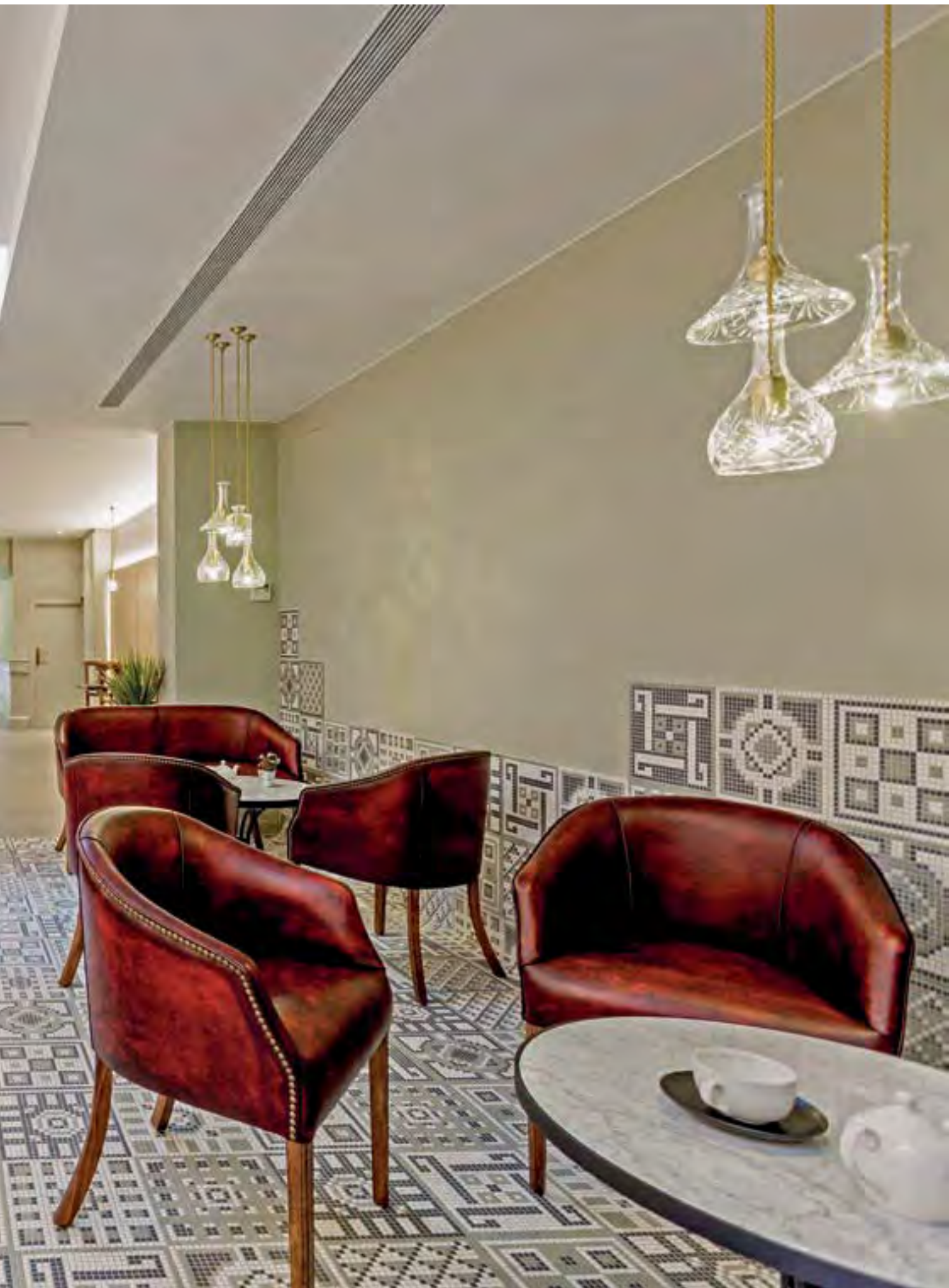
El Bruguier Cafeteria, Barcelona, Spain (personalised Memoria Ombra - 1,2x1,2 cm / 0,5"x0,5")