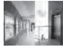
Train Station, Belfast, North Ireland, UK